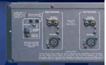
Back panel of Sunfire 300- two (300- two pictured, back)