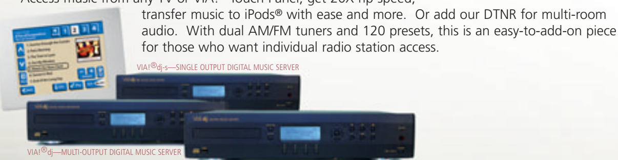
VIA!®dj-hc—HIGH CAPACITY MULTI-OUTPUT DIGITAL MUSIC SERVER